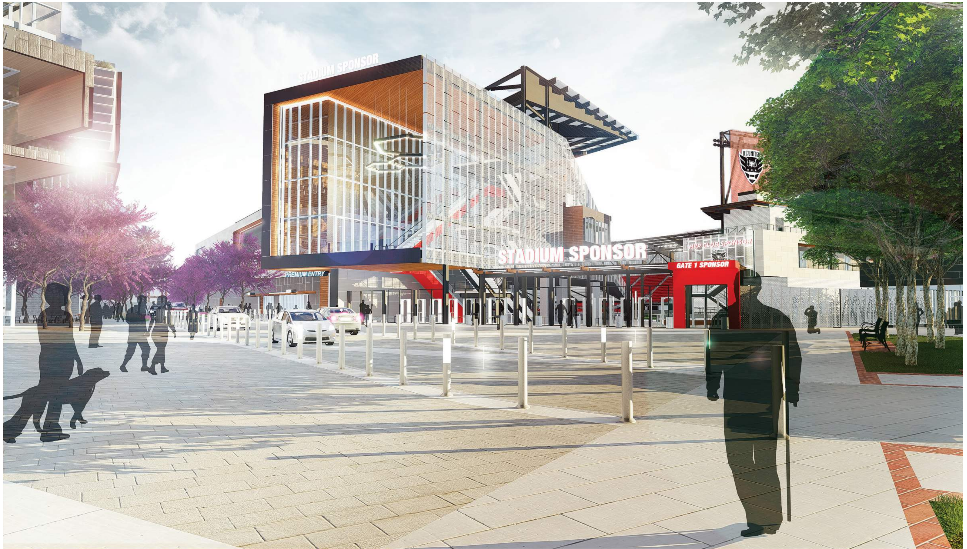
5.13 NORTHEAST ENTRY GATE RENDERING